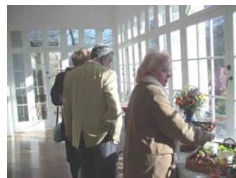
Guests enjoying the munchies