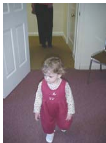
Even the younger crowd enjoyed the day.