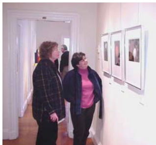
Two visitors admiring the images